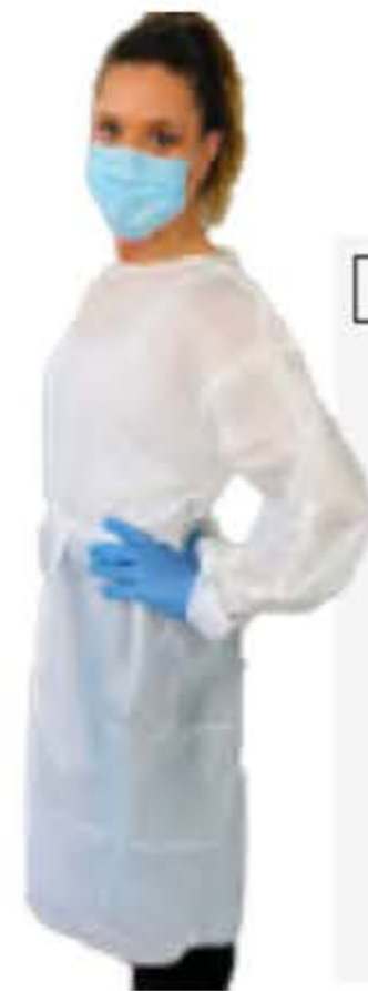
PERSONAL PROTECTIVE EQUIPMENT – PPE KIT